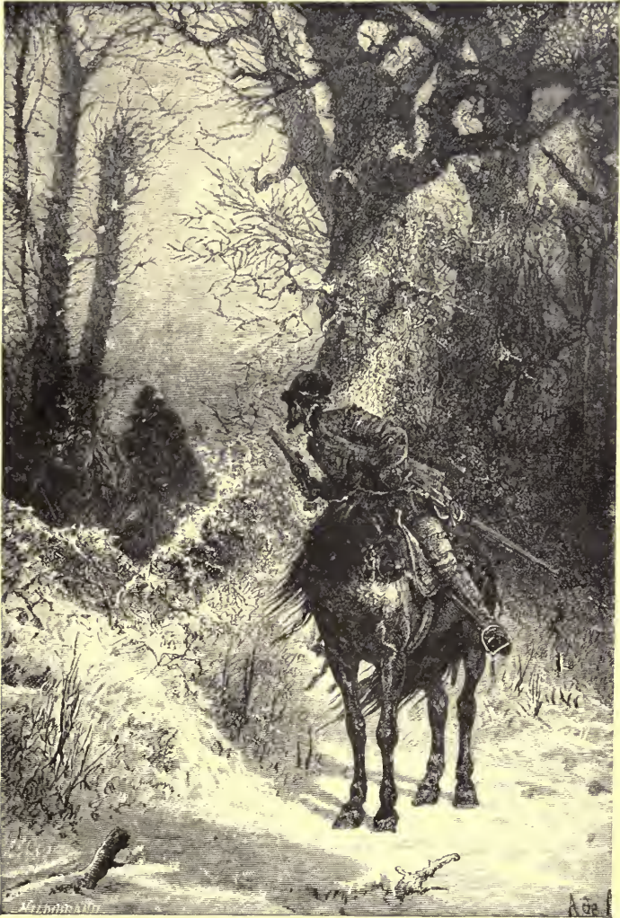
DUKE OF GUISE WAYLAID