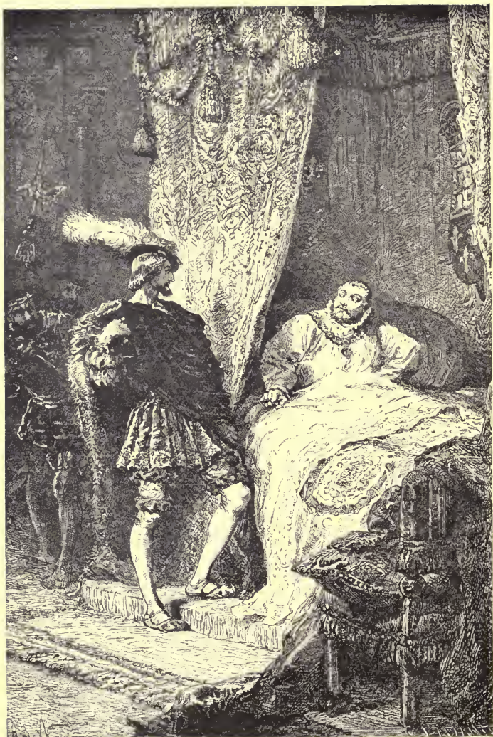
FRANCIS I. AND HENRY VIII.